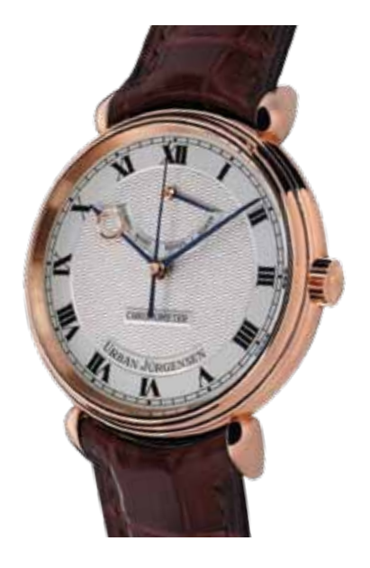
MEN'S WATCH PRIZE Urban Jürgensen & Sønner | Central Second